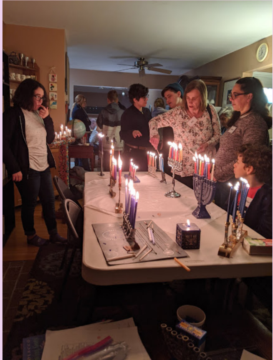
Jewish Cultural School Learning About Chanukah